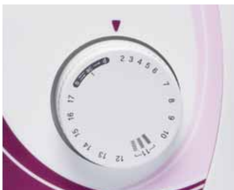
Easy stitch selection dial