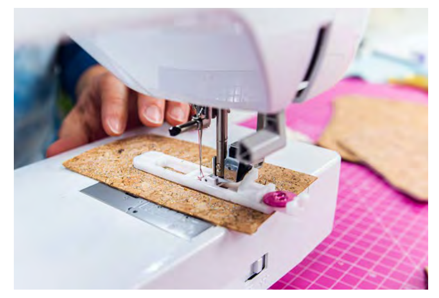
One-step buttonhole sewing