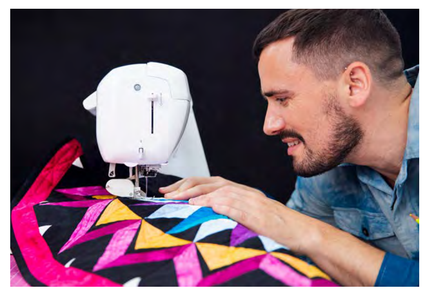
Walking foot and quilting guide included