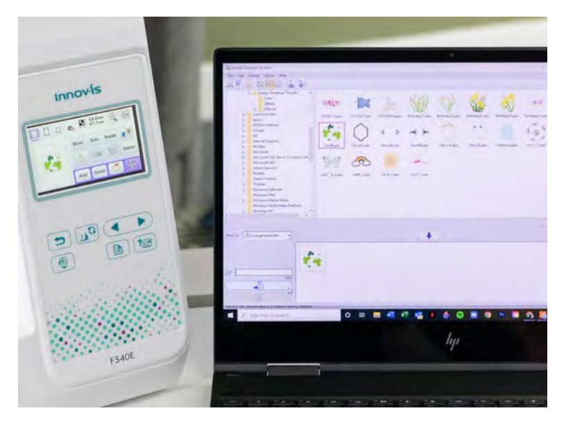
Wireless connectivity for design transfers and Artspira app connection