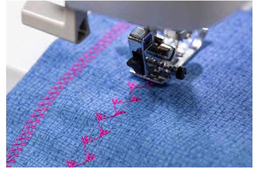
Variety of decorative stitches built-in